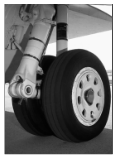
The G-IVSP's 66,000-pound max landing weight is made possible by more-robust rolling stock and wheel brakes, plus recalibrated main landing-gear strut damping.

Multiple leg trips without refueling also are a strong suit of the aircraft. For example, a G-IVSP with eight passengers can