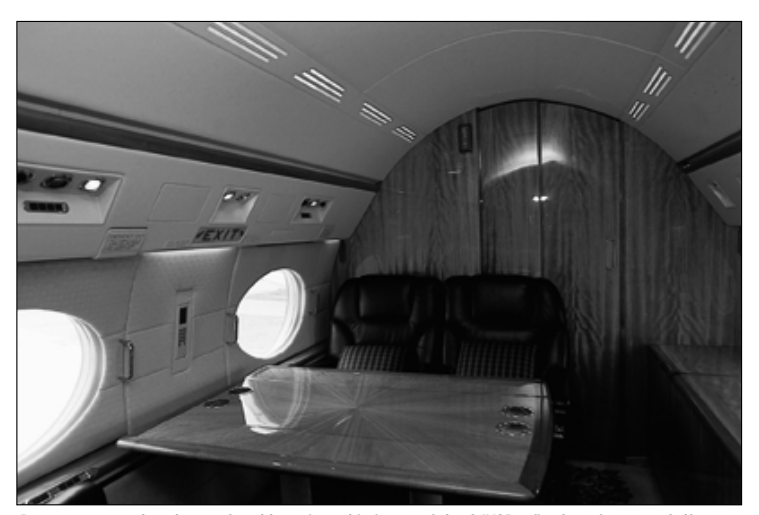
Passengers say that the comfortable, quiet cabin is one of the G-IVSP's five best features. Gulfstream Aerospace, which completed all but a few aircraft in B/CA's Operator Survey, generally received good marks for craftsmanship. Company officials say quality has improved in recent months.

facilities. For long overwater flights, though, few said they would stretch the range beyond 3,500 miles because of the paucity of suitable divert fields while en route and when approaching the destination airport.