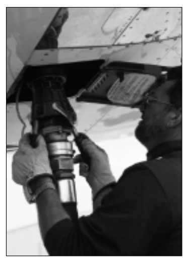
The G-IVSP has a 7,500-pound max landing weight increase, compared to the original G-IV, enabling operators to tanker less-expensive fuel for multiple leg trips.

While operators weren't shy about praising the G-IVSP, they didn't hesitate to point out its shortcomings. "The metal work isn't as good as it was on our G-II and G-III aircraft," one operator commented. "While our G-IVSP was still green, we saw uneven rivet patterns, rip-