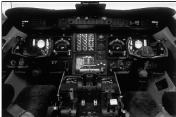
Operators said the SPZ-8000 avionics package (SPZ-8400 for serial number 1253 and subsequent) was quite reliable and capable. As shown in this photo, few opted to install the optional Honeywell-GEC Marconi HUD 2020.

On their longest trips, operators said they felt comfortable flying the G-IVSP 3,800 to 4,000 miles under no wind conditions. Some said they would fly as far as 4,200 miles, or more, if the weather is clear at the destination and there are several, suitable, VFR, nearby alternate landing