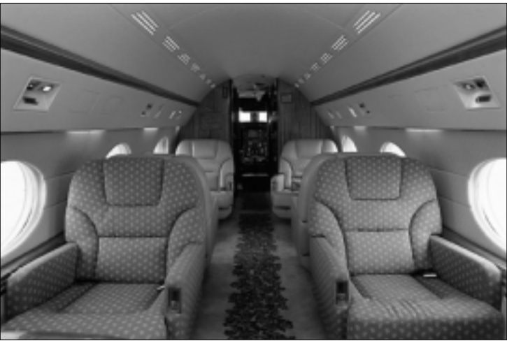
Cabin configurations vary, but almost all have three seating areas, with an aft galley and aft lavatory. About half of the operators said their aircraft have a second, forward crew lavatory.

Gulfstream officials weren't reluctant to own up to these concerns. "I'm not sur-