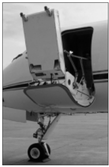
Some operators said that moisture intrusion into the main door seal was an ongoing problem.

The AC electrical power system received high marks, with most operators awarding the system an "A" or "B" rating. The Honeywell AC power converters are much more reliable than they were on early G-IV aircraft. Henne commented that the converters are four times more